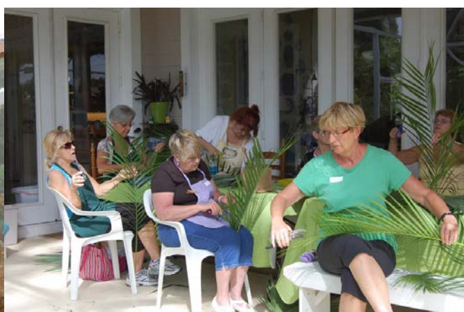
Figure 2- Our Busy Bees